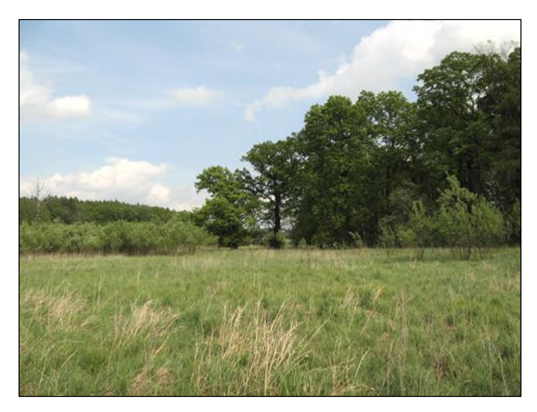
The swamps of Sruby is an area of meadows, shrubs, former pastures, swamps and forest remnant near great complex of east bohemian forests.