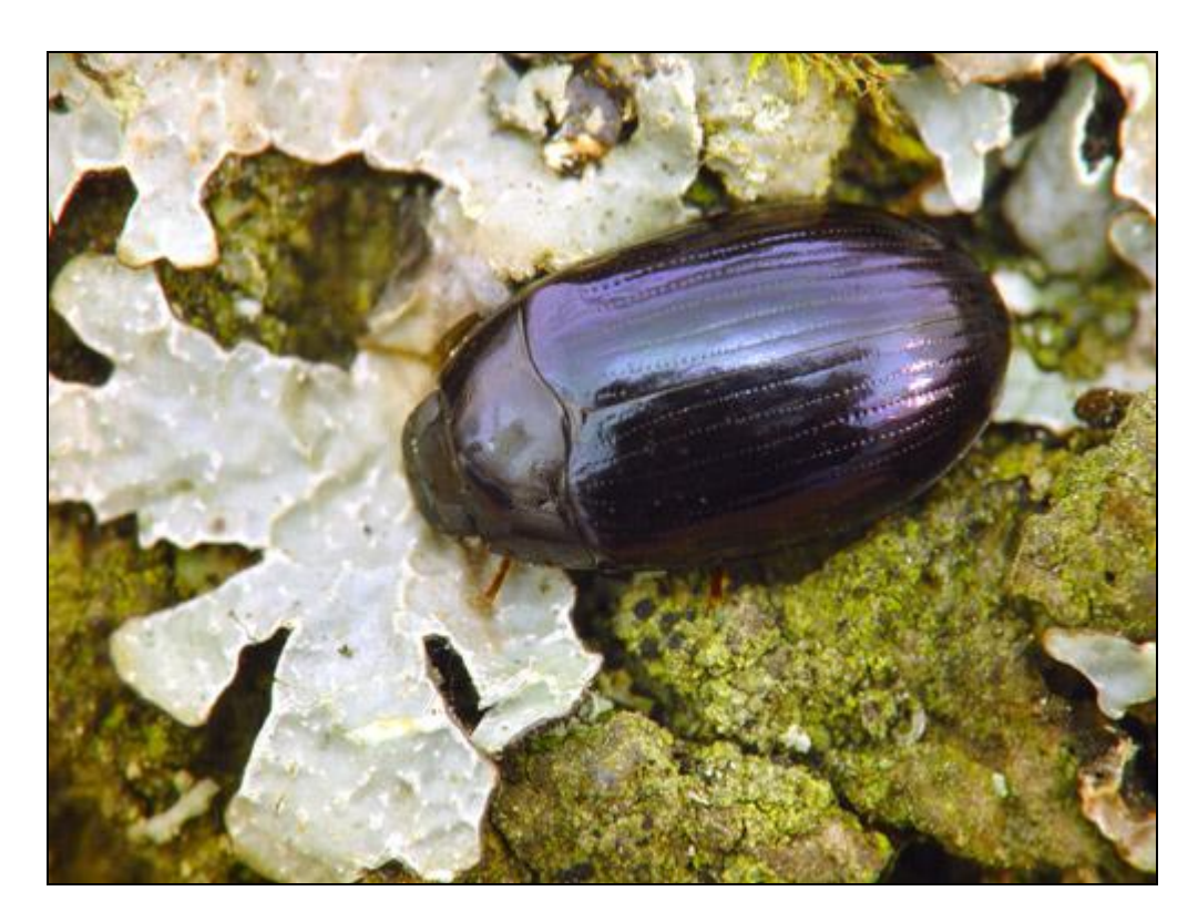
Adult of Platydema violaceum (author S. Krejčík, www.meloidae.com).