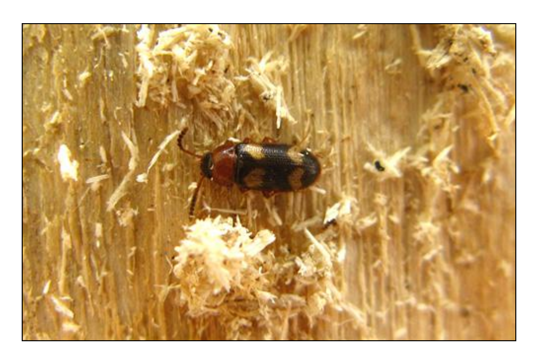
{\bf Adult\ of\ } {\it Mycetophagus\ fulvicollis}.