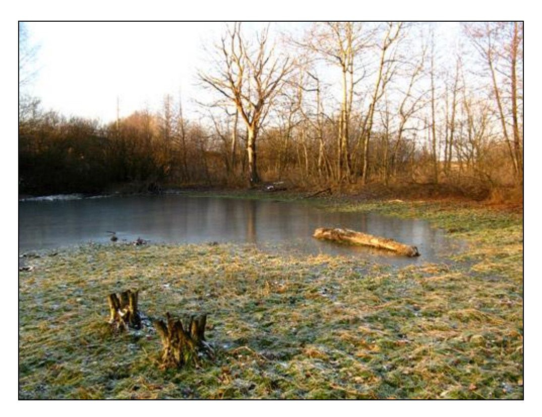
Western part of swamps in the winter.