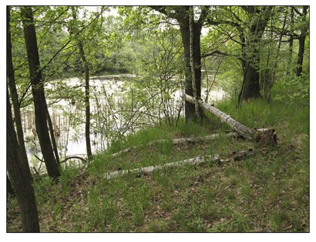
An interior of forest remnant with swamp and dead wood.