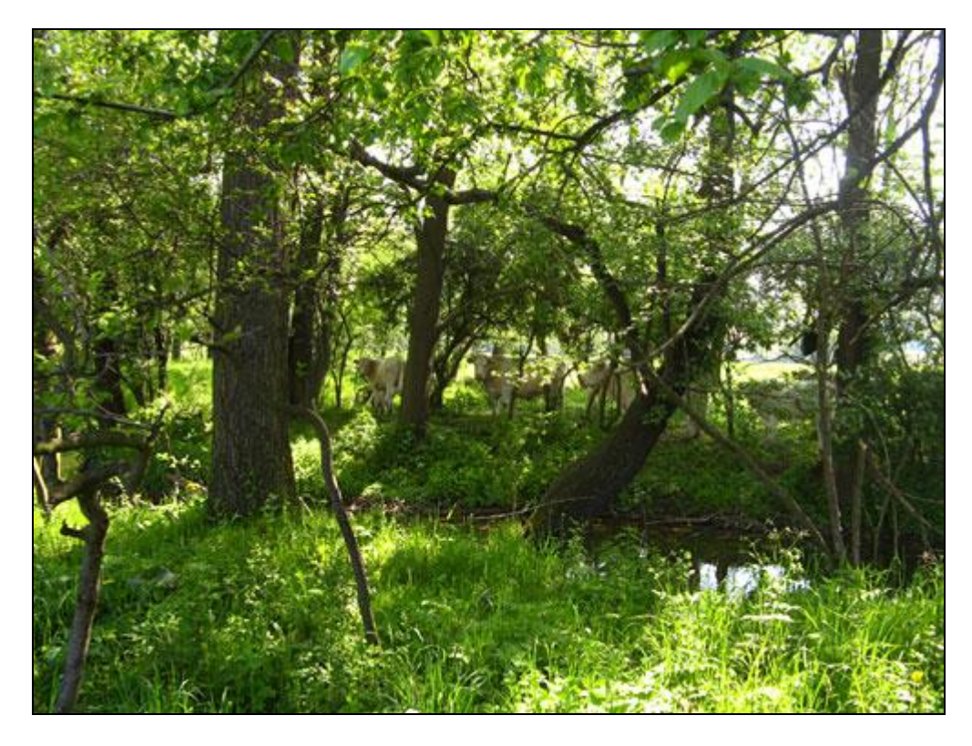
In surrounding of Loučná is still presented pasture of horses and cows.