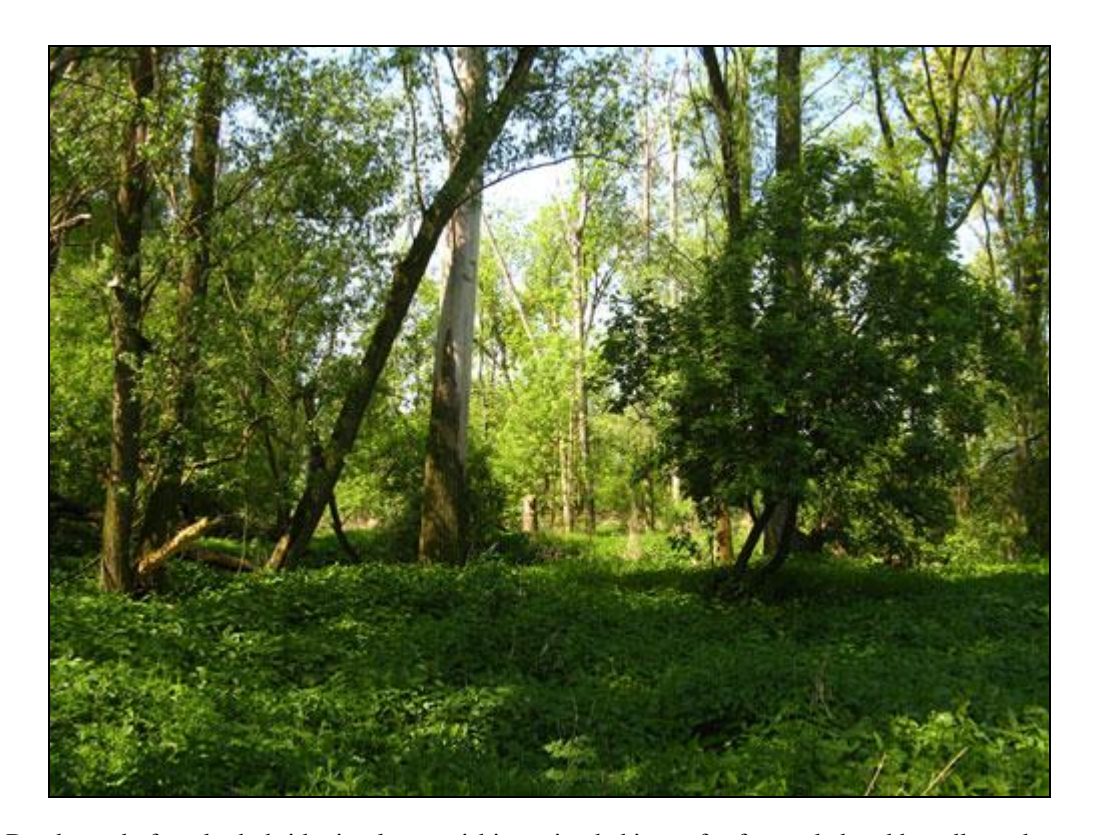
Dead wood of poplar hybrids simulate vanishing microhabitats of soft-wooded and broadleaved trees.