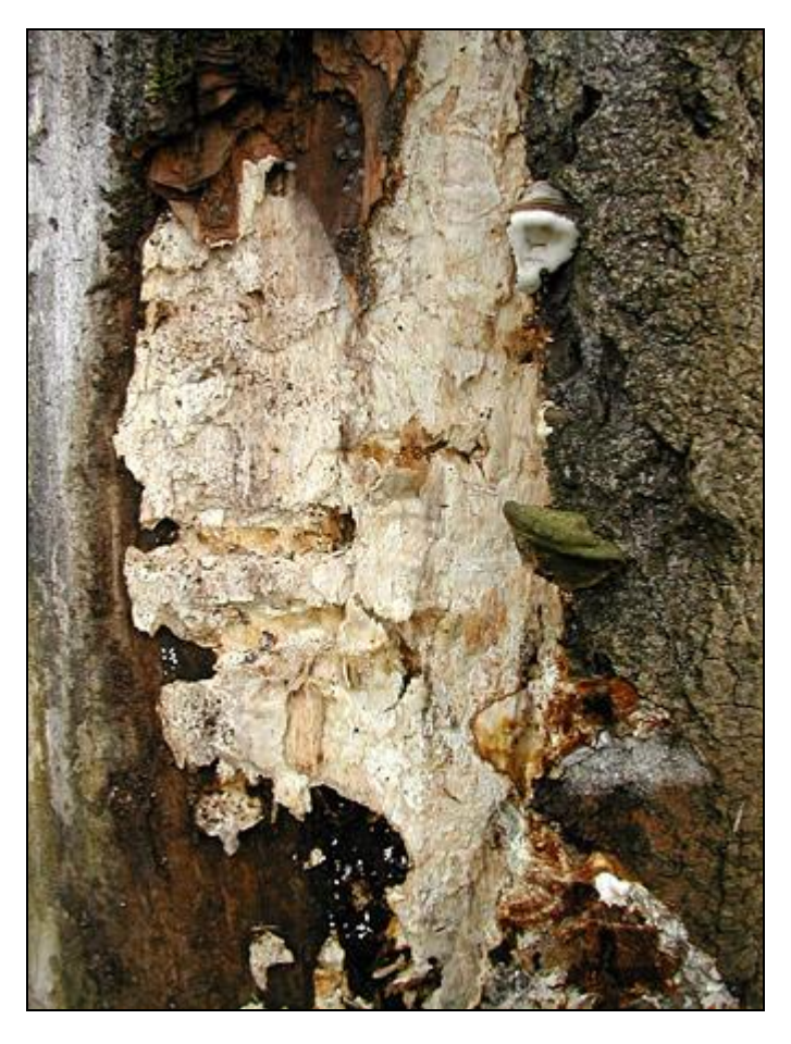
Dead\ pop lar\ stem-microhabitat\ of\ \textit{Platydema\ violaceum}.