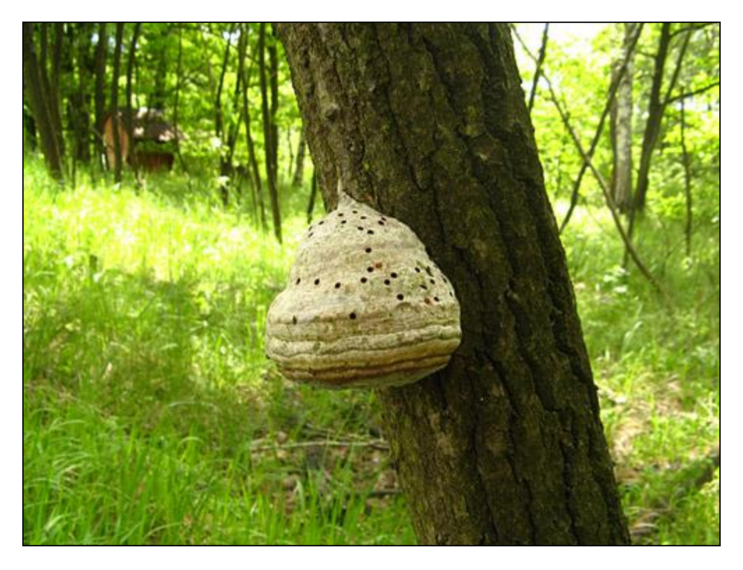
Quantities of dead wood with dead fruiting bodies of fungi provide habitat for many saproxylic species.