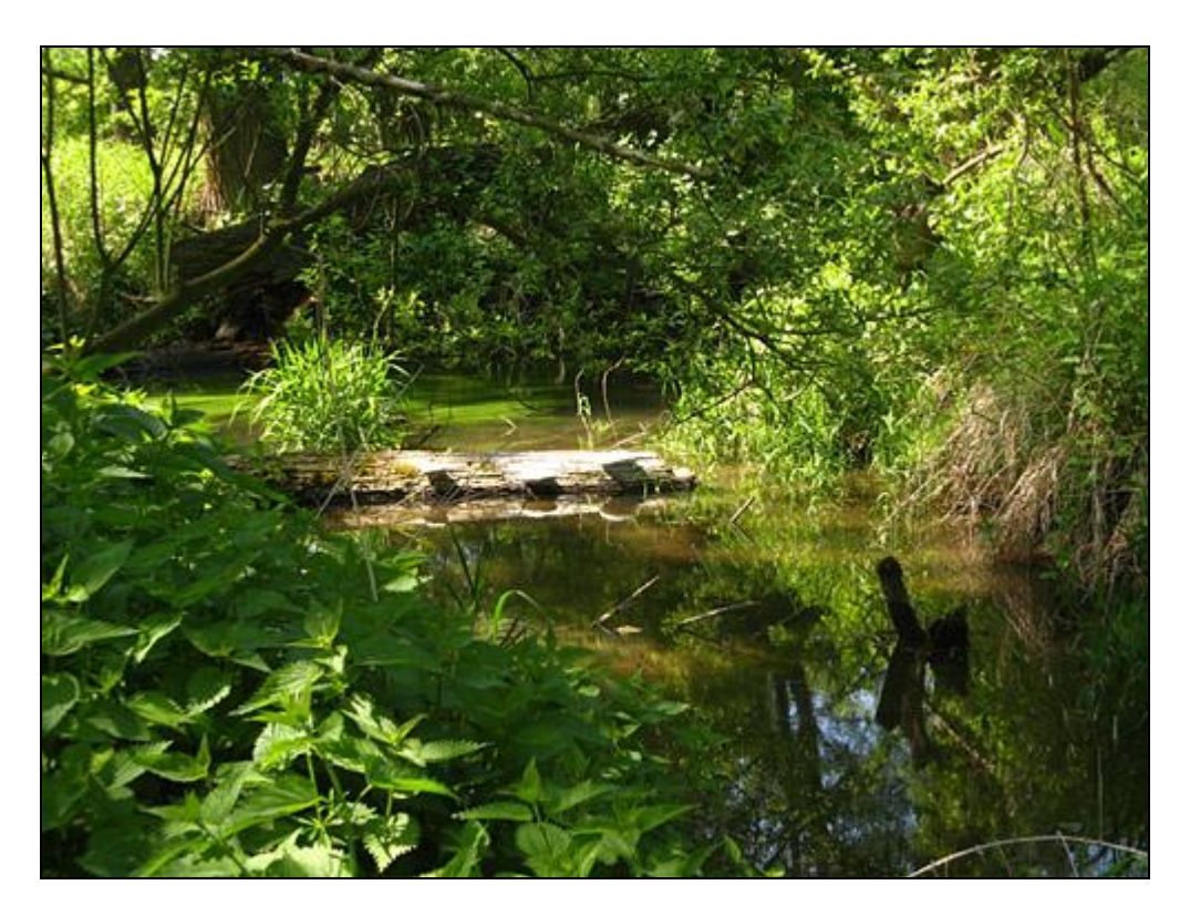
Meandered river Loučná provides large scale of habitats.